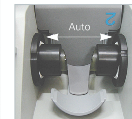
Auto-moving table with waterless probes