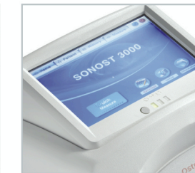
Touch screen color monitor