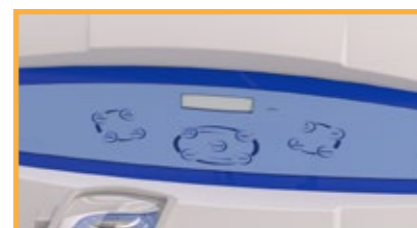
Clear arrangement of the buttons and easy to read two-line display