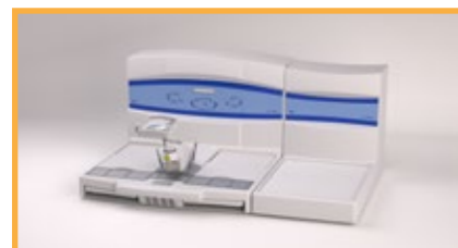
Cryo module can be arranged to the left or right of the dispensing console