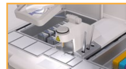
Dispensing area incorporating touch plate, cold spot, lighting and wells for forceps