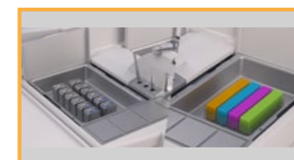
Removable trays for storage of cassettes and molds. Surplus paraffin is drained into removable waste drawers