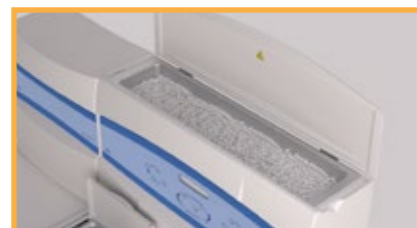
Capacity up to 5 l